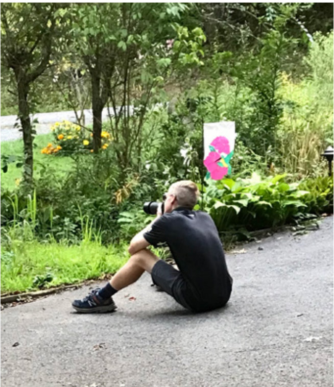
Sam capturing nature for a photo portfolio