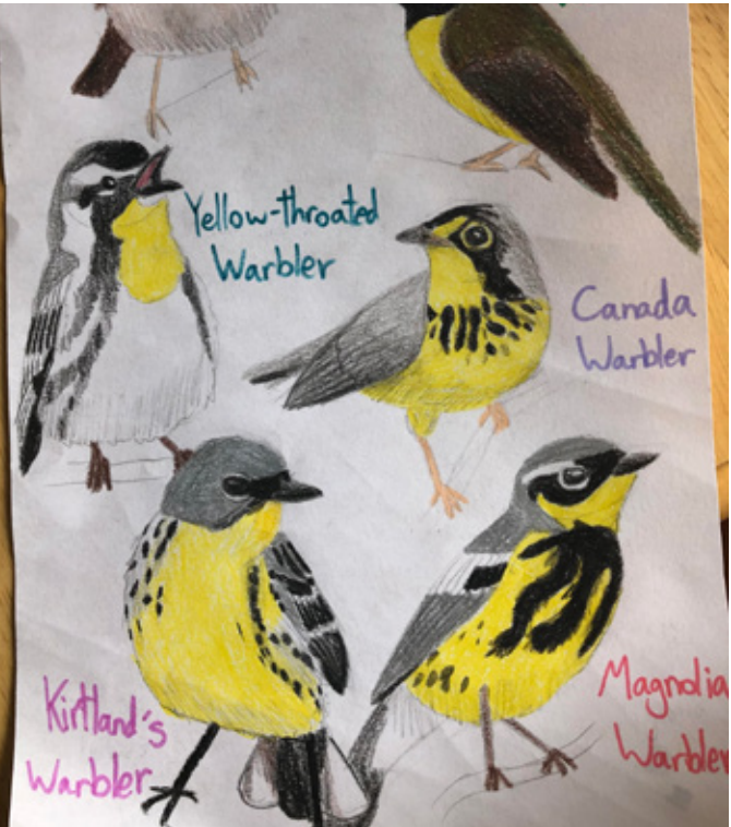
Sketches of Warblers by Mary